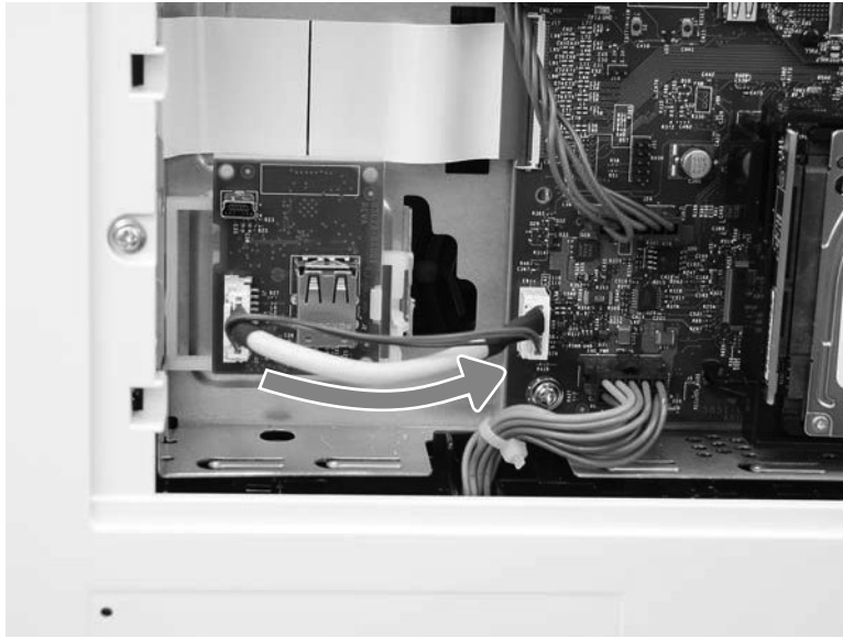
Figure 1-78 Connect the cable